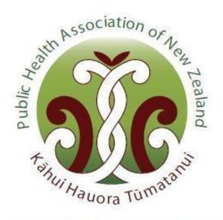
Good health for allHealth equity in AotearoaHauora mô te katoaOranga mô te ao